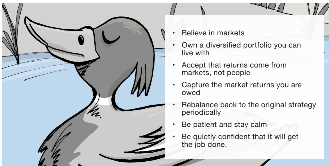
Figure 1: Systematic investing - the view from a client's perspective

If you are already one of our clients, you will by now be familiar with us telling you to stay calm at times of market jitters, that we will rebalance your portfolio on a regular basis, that returns come from the markets, that costs really matter, that a sensible long-term, diversified portfolio structure is key, and to avoid looking at your portfolio too often.