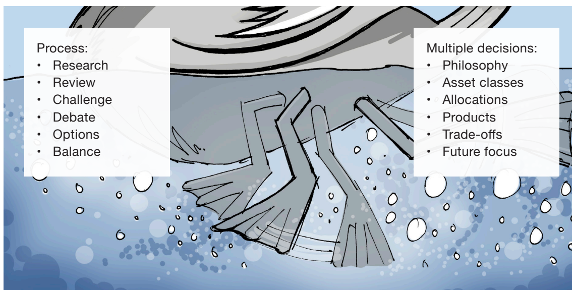
Figure 2: Systematic investing – the view from the Investment Committee's perspective

The broad terms of reference of the Investment Committee are set out below: